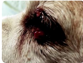
Tumor of the eyelid