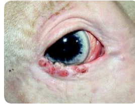
Tumor of the eyelid

Therefore, nothing for your patient to lick or pull on. Minimizing risk of infection.